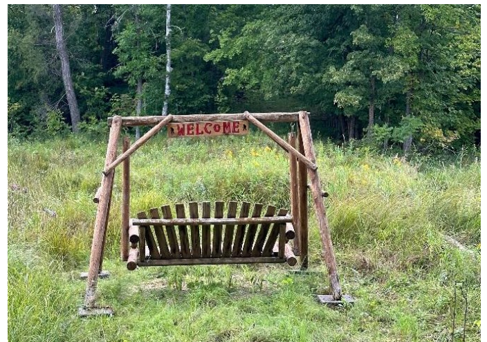
KID LAKE SWING

So next time you're out on a long walk, feel free to take a load off and enjoy what once was the main road. The swing is on the left side of Evergreen right by the channel.