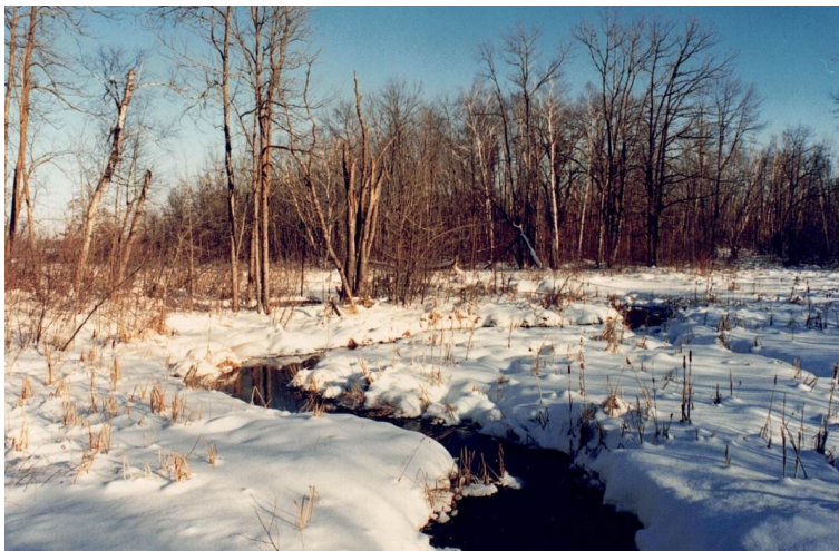
KID LAKE CULVERT

I'd like to give a special THANK YOU shout-out to those owners who chose to help financially. You know who you are, and without you, none of this would be happening.